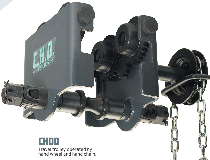
CHDD® Travel trolley operated by hand wheel and hand chain.