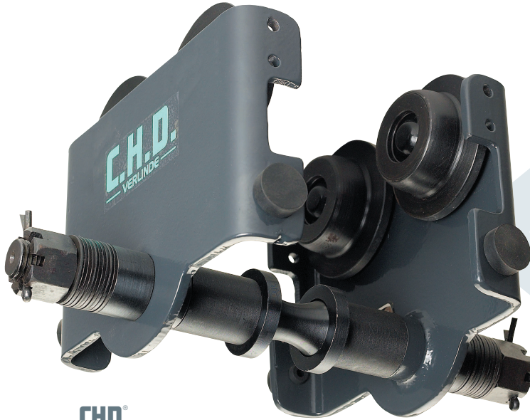
CHD® Manual push trolley operated by push action on load.

Manual travel trolleys for loads from 250 to 20,000 kg